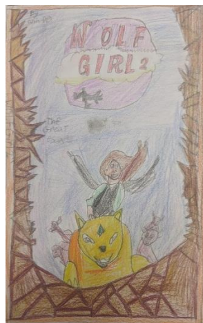
Chloe Skeers 4/5H

How great is this poster! Quite possibly one of the cutest drawn koalas I've seen too. Thanks Felicity (this may be hanging in my office).